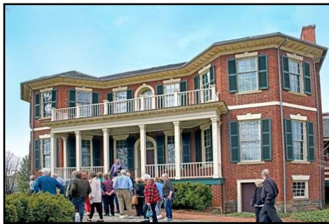
Point of Honor