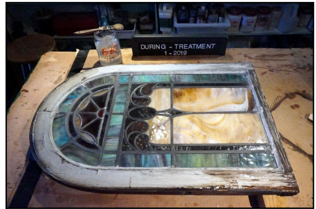
Conservation of the First Baptist Church stained glass window in progress.

As you may remember, the previous year's campaign also funded conservation of an altar chair and plant stand from the church. With the generous support of 24 donors, over $1,600 was raised. Conservation of the window totaled a little over $1,000. Almost $400 was applied to the conservation of the altar chair and plant stand. The remaining funds will go toward the preservation of the Historical Society's collections. (contributed by Corinne Midgett, Museum Registrar )