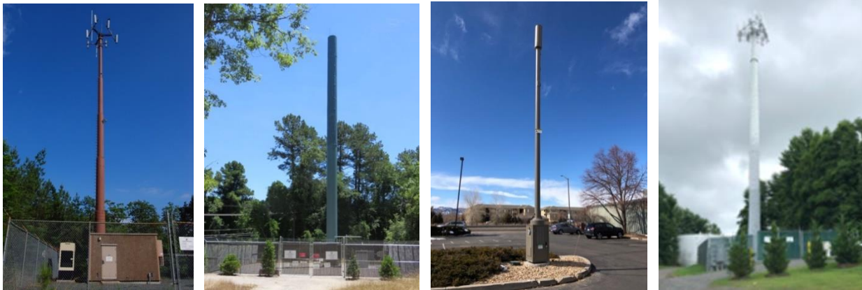
FIGURE 4.3.3.F1 STEALTH WIRELESS TELECOMMUNICATIONS FACILITIES PAINTED WIRELESS FACILITIES

(j) Signage Signs located at a wireless telecommunications facility shall be limited to ownership and contact information, FCC antenna registration number (if required) and any other information required by government regulation. Commercial advertising is prohibited. Notwithstanding, nothing in this section shall prohibit signage that is legally approved for other uses on the same lot or site on which the wireless facility is located.