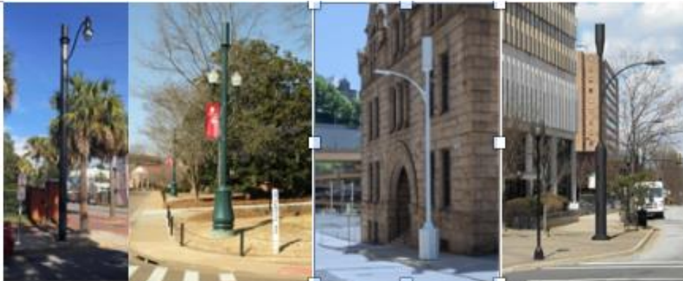
FIGURE 4.3.3.F3 CONCEALED BASE STATIONS