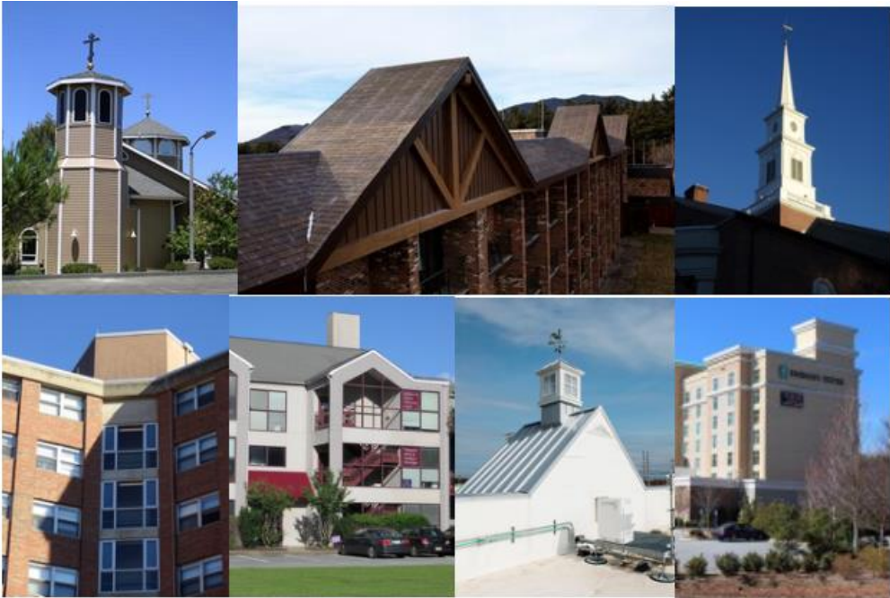
FIGURE 4.3.3.F4 CONCEALED WIRELESS SUPPORT STRUCTURES